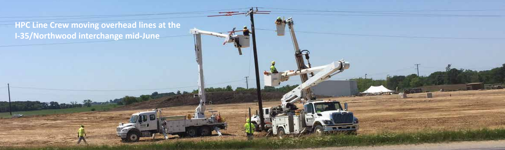
HPC Line Crew moving overhead lines at the I-35/Northwood interchange mid-June

A monthly publication for members of Heartland Power Cooperative | July 2020