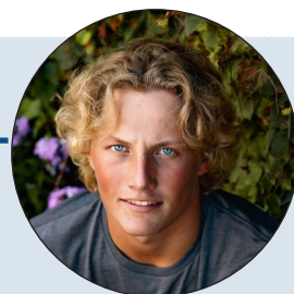
Tate Mayer Lineman Scholarship

Heartland Power is proud to award $500 scholarships to area high school seniors. The scholarship committee reviewed many great applications this year. Congratulations to these deserving recipients and we wish you, and all area high school seniors, the very best in your future endeavors.