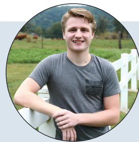
Ricky LaGue Jr. Lineman Scholarship